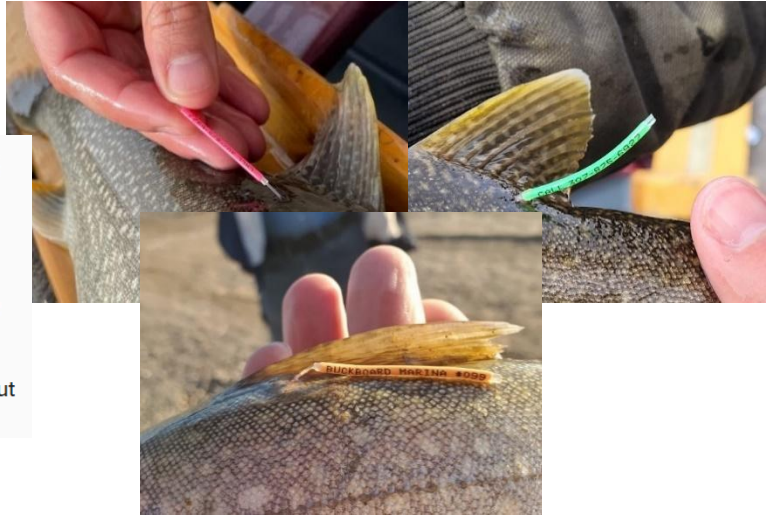
Floy Tag - tagging location and appearance on Lake Trout.